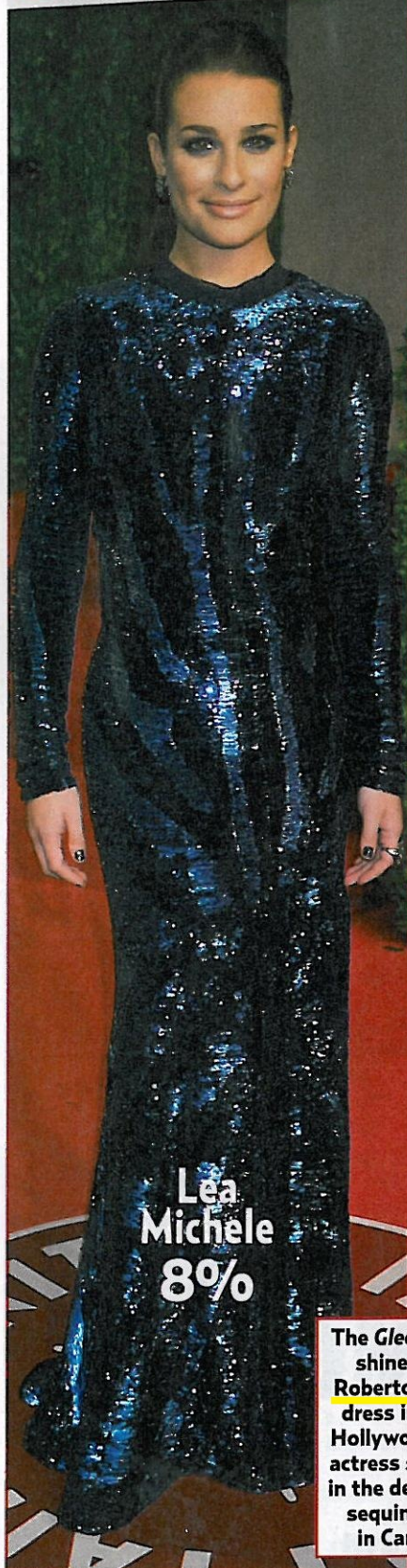
Lea Michele 8%

Us asked 100 people in NYC's Rockefeller Center